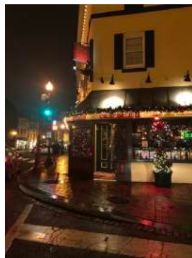
Cheerful Martin's Tavern on a Rainy Night