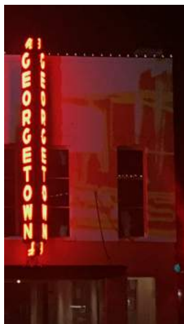
Glow on the Georgetown Theater