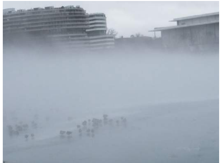
Will the stormwater tunnel be as invisible to Georgetown as the river is on a winter morning?

Visit cagtown.org/bigtunnel to view CAG's public comments on the proposed tunnel.