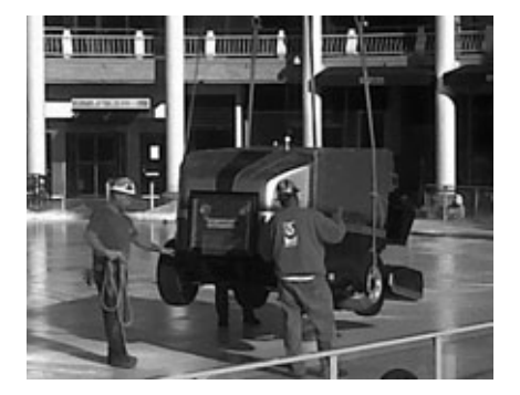
Delivery of the Zamboni machine by crane to the rink

The rink area is substantially larger than the fountain pool, which entailed constructing a base of foam blocks and plywood lining the bottom of the pool and part of the brick terrace. Then a very elaborate grid of small-diameter plastic tubing was installed to carry the coolant. The rink is walled by glass panels and a ring of lamplights. The base of the column on one side of the pool/rink serves as a garage for the Zamboni machine which cleans and resurfaces the ice.