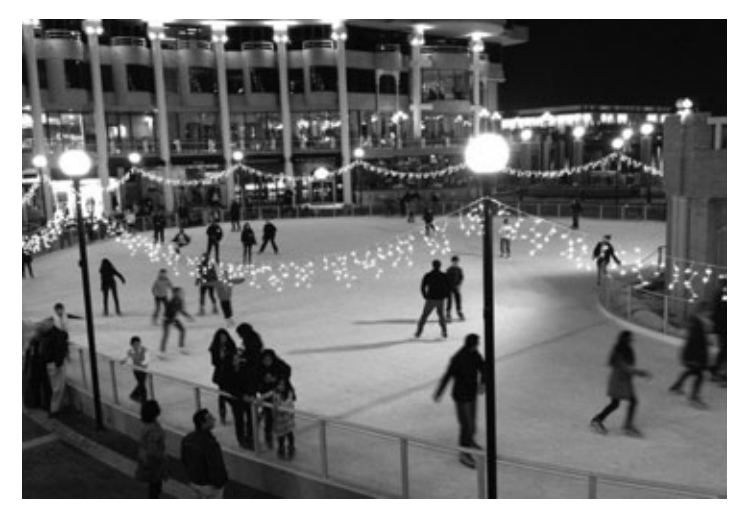
Georgetowners enjoy the new ice rink now open at Washington Harbour

he Concerts in the Parks Committee is kicking off the 2013 season with a family skating party at the new ice skating rink at Washington Harbour on Sunday, January 13, from 4 -6:30. Tony & Joe's is hosting with hors d'oeurves and cocktails along with snacks and warm drinks for the kids during the party. They will also offer 10% discount for anyone who wants to stay for dinner. The Harbour skating rink will give