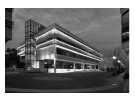
House of Sweden will host Georgetown ARTS 2013

House of Sweden is sponsoring the CAG event and has generously made several of their stunning rooms available.