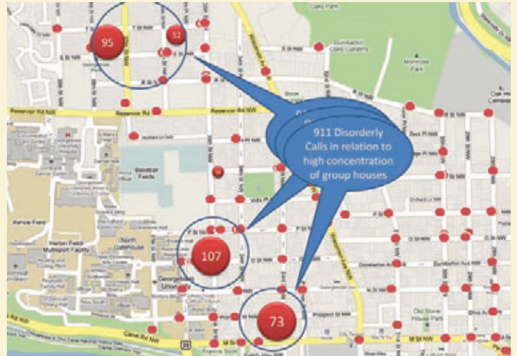
Disorderly conduct 911 calls distribution in the residential areas

In 2009 our police department had to service a disproportionate number of 911 calls for Disorderly Conduct between 10pm and 4am all related to blocks closest to campus. See the map above to get a clear idea where the calls are coming from.