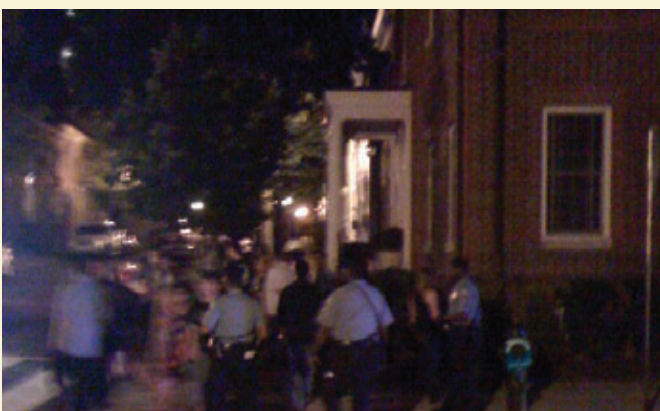
Several police officers controlling crowds and intoxicated individuals at midnight