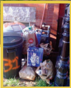
Common view in front of student rental houses.