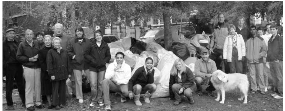
Clean-up crew by the mountain of trash collected.