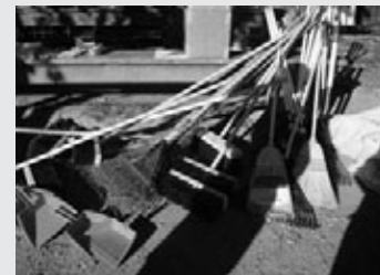
Clean up tools at the ready