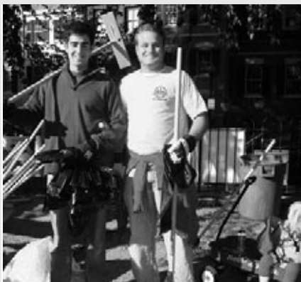
GU students go to work at cleanup day

Saturday October 23, the Citizens Association of Georgetown (CAG) and Georgetown University teamed up to clean up. It was the annual neighborhood event to spruce up parks, sidewalks, and tree boxes. Students and neighbors alike swept, weeded and mulched and then returned to Volta Park for a barbecue with the Georgetown University Grilling Society.