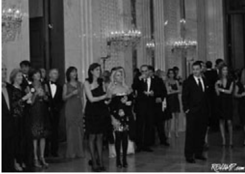
Crowd during the presentation of awards