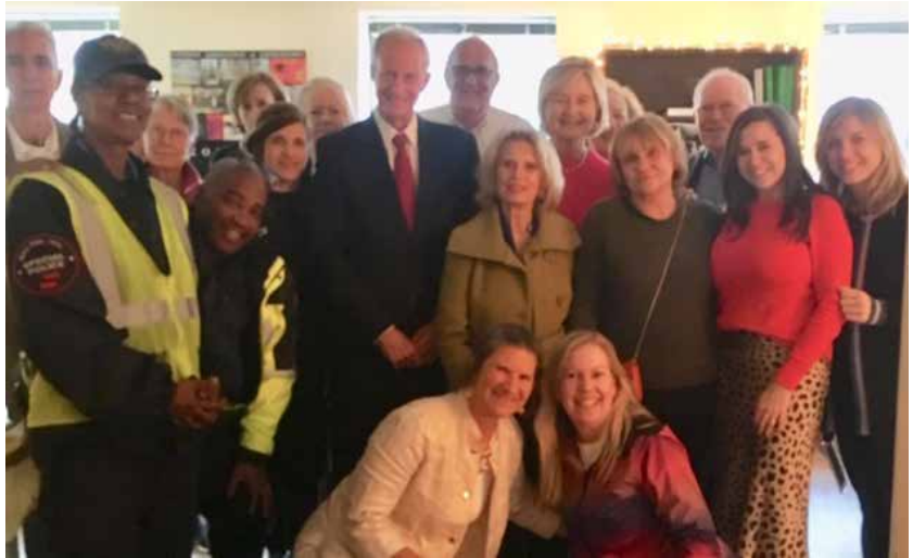
Gathering at CAG office to learn the latest from MPD.