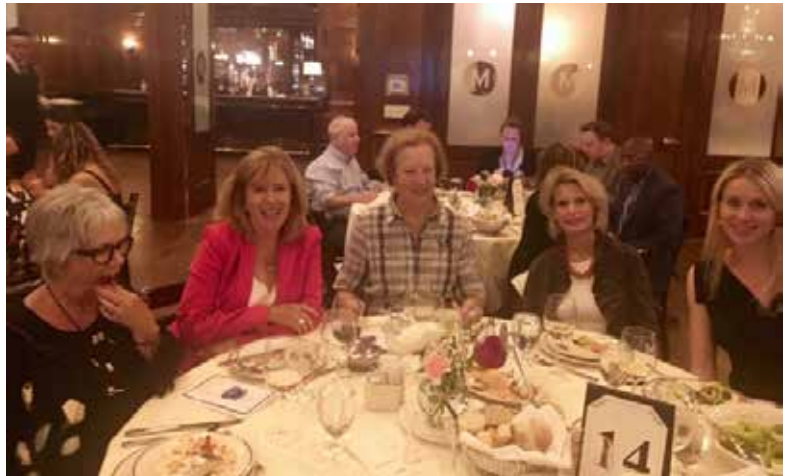
Honoring the brave 2nd district police and volunteers at the annual MPD awards.