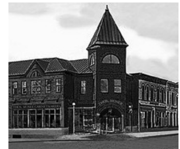
Thos. Moser Showroom at M and 33rd Streets

Congress passed the Old Georgetown Act in 1950 which set forth and designated the Georgetown Historic District. The Act defined the boundaries of historic Georgetown and gave the U.S. Commission of Fine Arts the authority to appoint the Old Georgetown Board (OGB) made up of three architects, to conduct design reviews of semi-public and private structures within Georgetown's boundaries. Georgetowners have been protected by legislation, regulation, and private action to