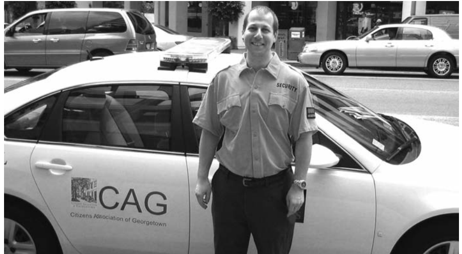
CAG Public Safety Program patrol cars are now clearly identified with the CAG name and logo in bright blue on the rear doors. Under contract with Securitas Security, the CAG guards — and cars with flashing lights — provide surveillance Wednesday through Sunday nights.