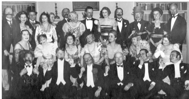
A glamorous costume party of yesteryear at Evermay.