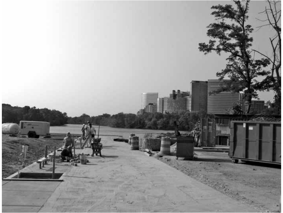
Work begins on a brick path leading to the Georgetown Waterfront.

These first two weeks of September have been transforming. The first sod strips of grass are now in place, small shrubs line the embankment wall, bushes parallel the paths, and two dozen trees (of good size) are in the ground. Bricks, cobbles, and pavers are now topping the path underlayment.