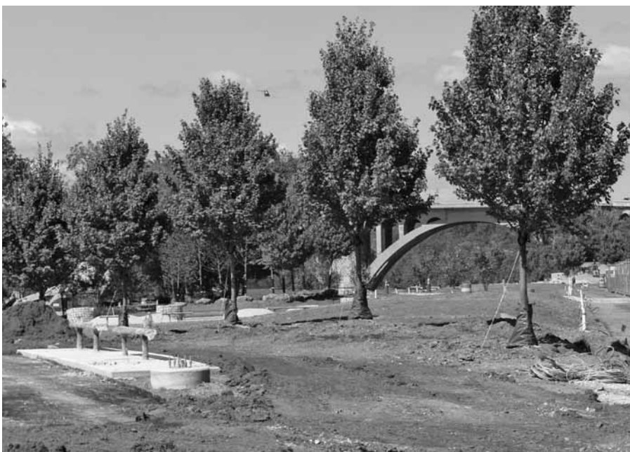
Five of the new large trees at the new Waterfront Park.

Work is also well underway on a small park along K Street between 29th and 30th streets. This park is being built by the developers of Harbourplace, and will have a layered appearance, sloping up from K Street to the Harbourplace building. When this and the Waterfront Park are done, a swath of green will stretch continuously along the south side of K Street from Rock Creek to Key Bridge.