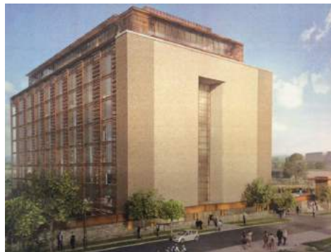
Another view of the revised design looking from 29th St.