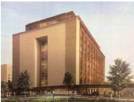
View of the revised design for the former West Heating Plant, looking from 29th St.

The Commission reviewed the latest designs on September 20. A review by the District's Historic Preservation Review Board is scheduled for November 2.