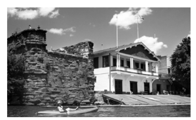
The Potomac Boat Club - Make your reservation now!