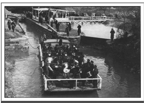
Ceremony at Lock 1, February 22, 1939. (GSA's Plant now occupies area to right of lock.)

Official consultative parties can be designated as participants in the development of the MOA. The consultative parties can include other Federal agencies with an interest in or purview over the property, advisory neighborhood commissions, community organizations, national or regional associations with an interest in the historic use and aspects of the property. After the MOA is signed, GSA can complete its compliance with the remaining requirements of NEPA and start the auction.