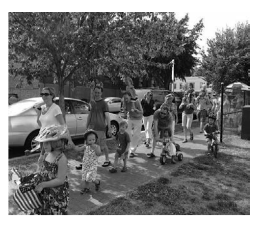
July 4th Parade around Rose Park