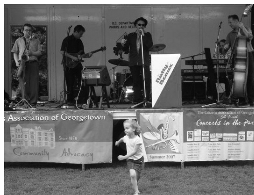
Groovin' to the Natty Beaux Band