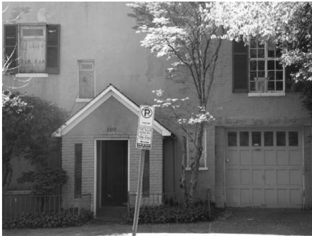
Fire damaged this P Street house

Soon this house will be offered for sale “as is.” A contractor has been chosen to do minimal repairs to the front façade of the house. New windows will be installed on the P Street side of the house and parts of a new roof will be put on. Other than that, the house is as it was after the fire. The kitchen remains a shell for the new owners to install their own dream cooking chamber. The interior charred walls