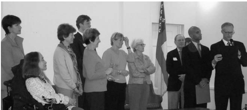
Friends of the Waterfront Park were honored with the William A. Cochran Award