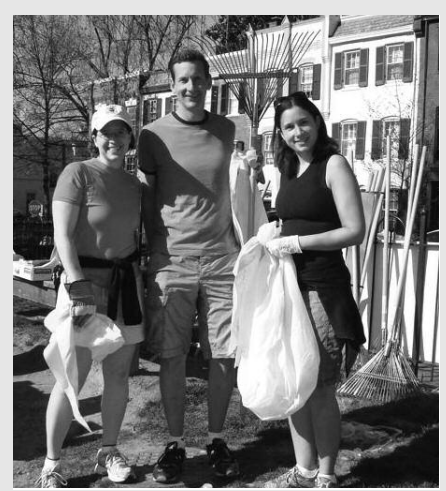
The CAG Georgetown University clean up day on April 18 was a great Success!