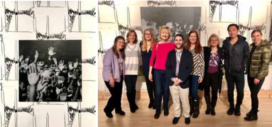
Left: Artwork by Glenn Ligon on top of a wallpaper design featuring the Washington monument designed by Andy Warhol and never put into production.