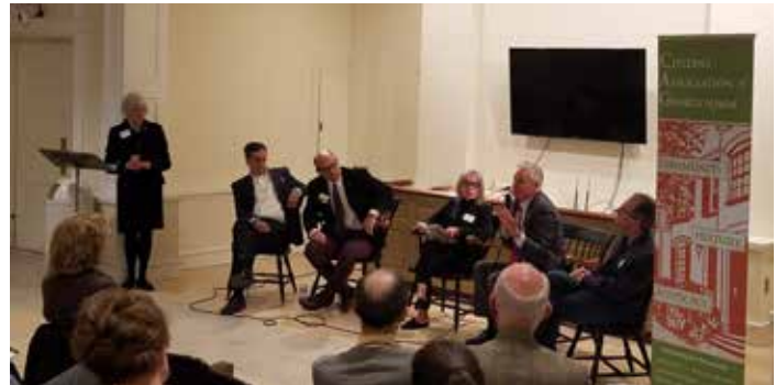
Panel discussion participants