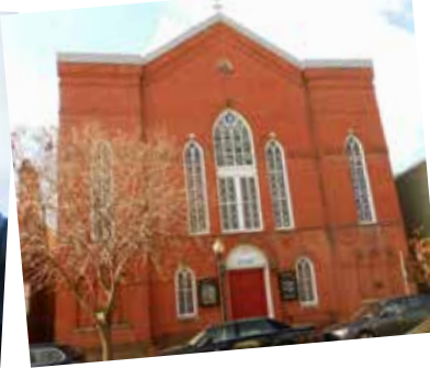
Mount Zion United Methodist Church