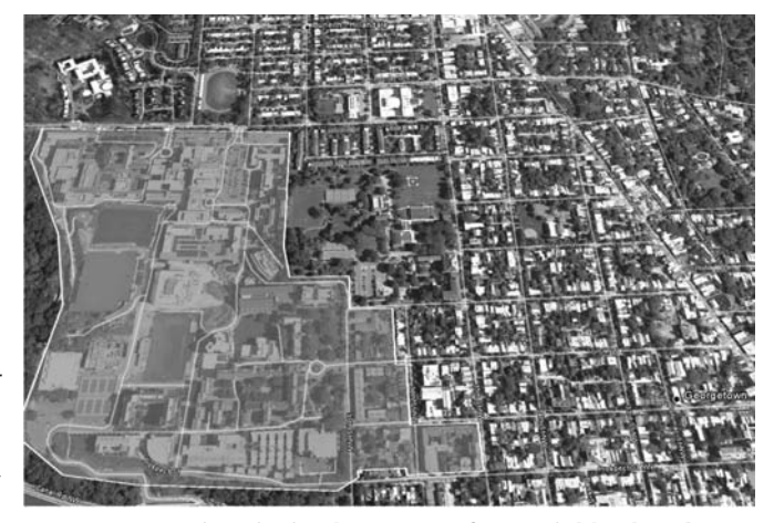
Georgetown University is a large part of our neighborhood

Last fall, Georgetown University held open meetings to highlight elements of its plan. In these discussions, it became evident that the plan does not address the adverse impact of more than 1,200 students already living in