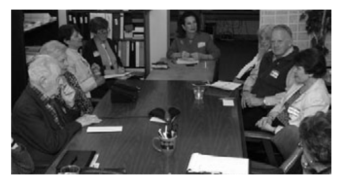
Discussion at the Georgetown Village meeting

Much of the discussion focused on how to let Georgetowners know about the advantages of forming and joining Georgetown Village. A survey was sent out last fall, but we heard back from only a few people. The survey is still available on the Citizens