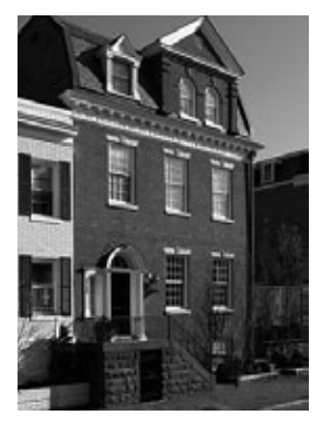
3249 N St will be on the House Tour

The 2010 Tour features a rich range of residences, from Patrice and Herb Miller's