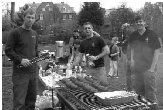
GU Grilling Society provided great picnic fare after cleanup.

After cleaning, everyone will return to Volta Park for a fabulous barbeque by the Georgetown Grilling Society. There are no better hamburgers to be had in all of Washington. Hot dogs, fixings and drinks will round out the fare. This is a family event for everyone, from youngsters to grandparents, and it's a great opportunity to get to know young GU students who come to help out.