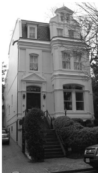
Pictured are two of the eight to ten homes which will be featured on this year's House Tour.