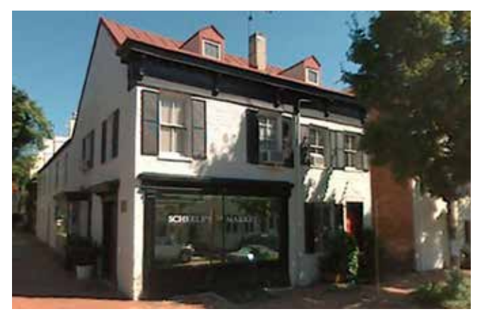
Scheeles Market at Dumbarton and 29th Street

This potentially had real consequences. When the future of Scheele's was in doubt due to the Scheele family putting the building up for sale, it was never an option for the store to simply pick up and move across the street. The