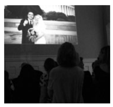
The beginning of slide show