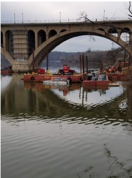
Pepco's contractors busy at work at 34th and Water streets. For most of the past six months, Water Street is reduced to two lanes, and sidewalks are closed, because of the size of the work zone.

Reconstruction of Locks 3 and 4 on the C&O Canal. Work began in the fall, and is currently underway principally at lock 4 (west of Thomas Jefferson Street), and the canal walls just west of Lock 4. The reconstruction of the basin between Locks 3 and 4 represents the major portion of the project, and has yet to begin in earnest.