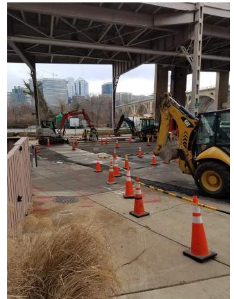
The foreground shows repair work underway at and near Lock #4.