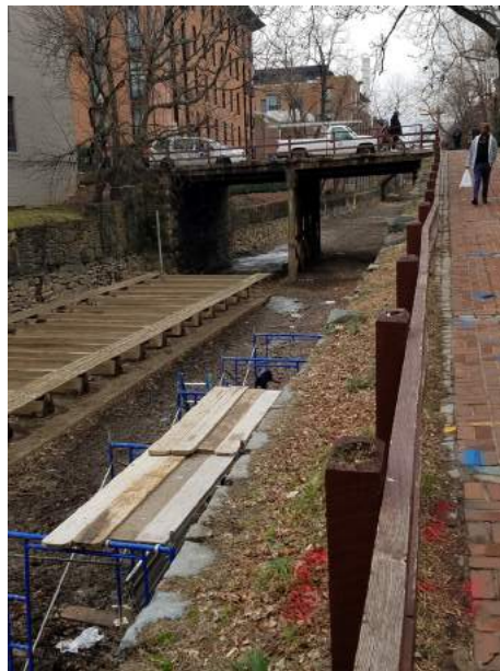
Ongoing work at Key Bridge.