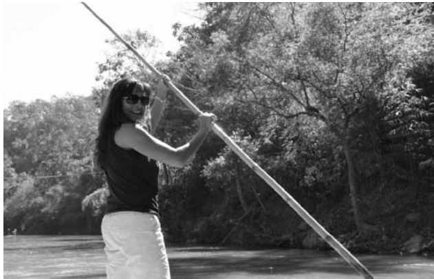
My transportation in Thailand

Second, Bob vom Eigen provides information about The National Park Service feasibility study on the location and size boat house structures along the Potomac River in Georgetown. The study comes after years of unsuccessful deliberations over the size and location of the boat house proposed by Georgetown University in 2006. There is no disputing the critical need for more boat house capacity. Thompson Boat Center is severely