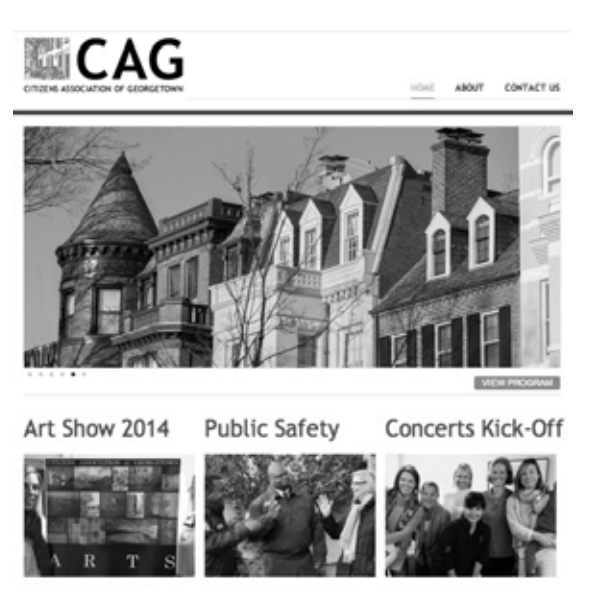
A look at the new CAG home page www.cagtown.com