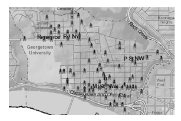
Map showing locations of fourth quarter crime incidents.

Don't forget to make your public safety tax-deductible donation. Your contribution is important to continue and expand the programs already in place. When you make your donation you will receive a window decal to indicate you are a donor along with an updated list of guard and police contact information. Thanks to all our Block Captains, CAG Guards, and supporters of the CAG Public Safety program.