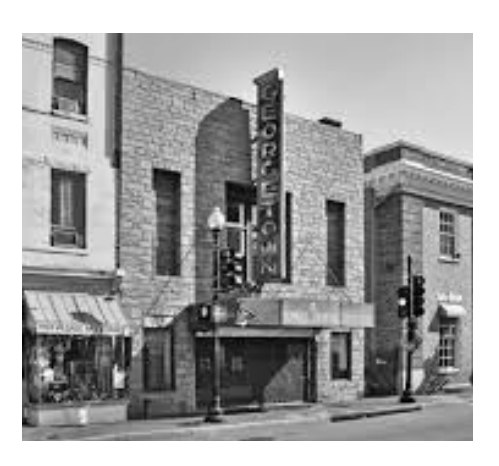
The old Georgetown Theater on Wisconsin Avenue near O Street.

down from west to east, mirroring a similar sloping of the theater floor (the movie screen was at the east end of the building). Bell proposes to excavate the existing floor, and create a new below-grade floor. Additionally, he has proposed two, then three, floors above the below-grade floor. The height and appearance of these