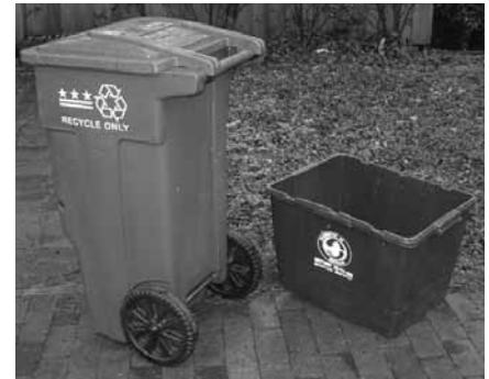
(Left) Blue rolling recycling container (24" front to back with handle, 37" high, 18½" across the front) and (right) existing green/purple open recycling container (17" front to back, 15" high, 22" across the front).

received blue, rolling, covered recycling cans. When polled, many people in Georgetown said that they did not have room to store the cans and requested that the neighborhood keep the existing smaller green/pur-